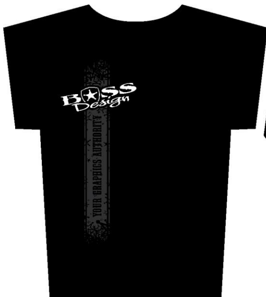
Short Sleeve Front Print