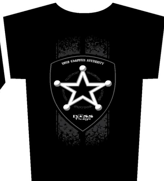
Back Print All Shirts